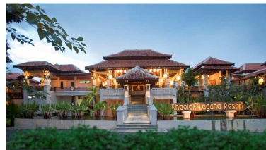
Hotel Main Entrance

We will be staying in Laguna Khao Lak Resort, one of the best in Khao Lak. In natural setting by the beach on Highway 4, it is a fusion of Chinese, Indian, Thai and Burmese architectural. Be pampered by its ambience friendly staffs and excellent food.